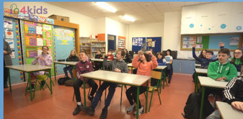
Still from the Gael Scoil Dara film.

in4kids also serves as the central hub for the pan-European Clinical Trial Network, conect4Children (c4c) . The official launch of the in4kids network took place in January 2023, marking a momentous milestone for children's research in Ireland.